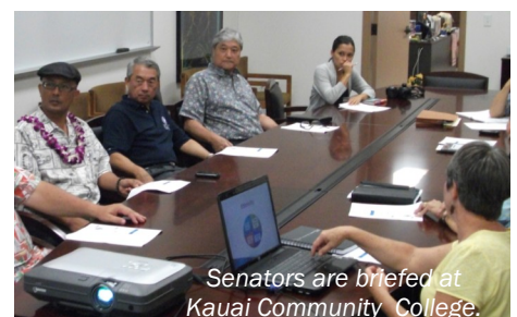
Senators are briefed at Kauai Community College.