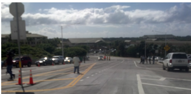
The new Kapolei interchange was dedicated recently, providing better access between Kapolei city and the H-1.